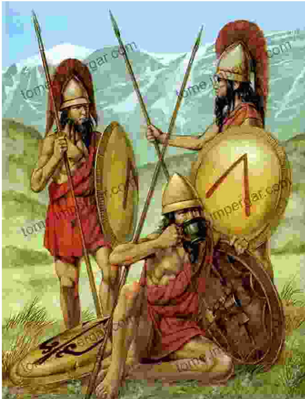
The Reality of Ancient Combat: A Grim Tapestry of Blood and Pain

In reality, ancient warfare was far less glamorous. Battles were chaotic, brutal, and often decided by sheer numbers rather than cinematic swordplay. Soldiers fought in close-packed ranks, their weapons clashing in a cacophony of steel on steel. The focus was not on individual heroism but on the collective might of the army.