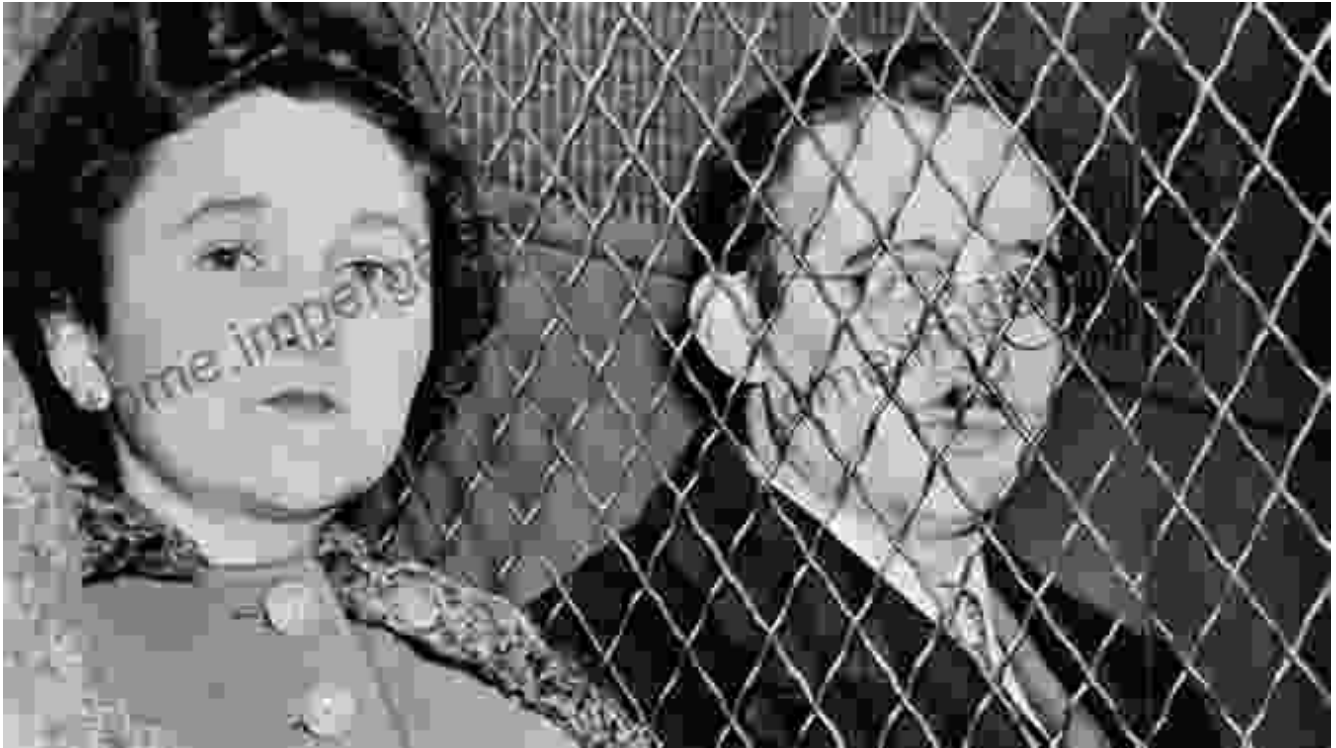
Julius and Ethel Rosenberg, executed for espionage

The FBI's involvement in some of the most notorious cases in American history adds to its mystique. We revisit the infamous Rosenbergs espionage trial, the assassination of President John F. Kennedy, and the Watergate scandal, examining the FBI's role and the lingering questions surrounding these pivotal events. The book presents a fresh perspective on these iconic cases, drawing upon previously unreleased documents and eyewitness accounts to shed new light on the FBI's actions and legacy.