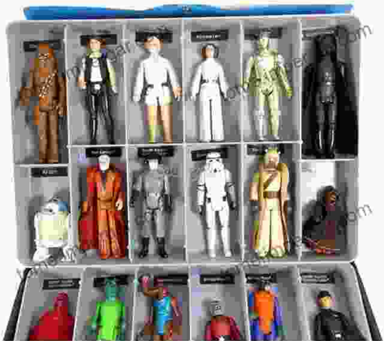
Toys, Games, and Action Figure Collectibles of the 1970s: Volume III Pocket Super Heroes to Star Trek :