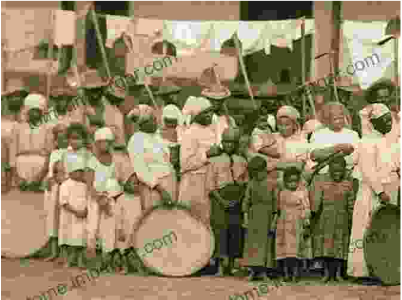
Freed People in Bahia, Brazil